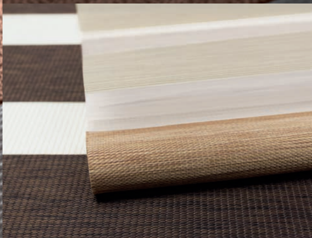
MALIN, MOA and LIV are particularly aligned with nature