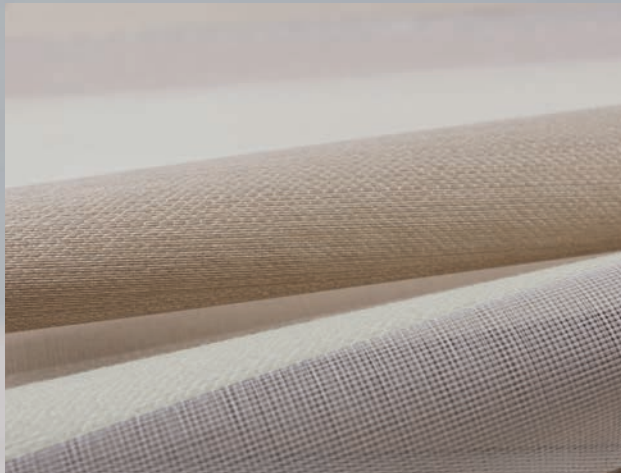
ALVA and FINYA stand for natural elegance