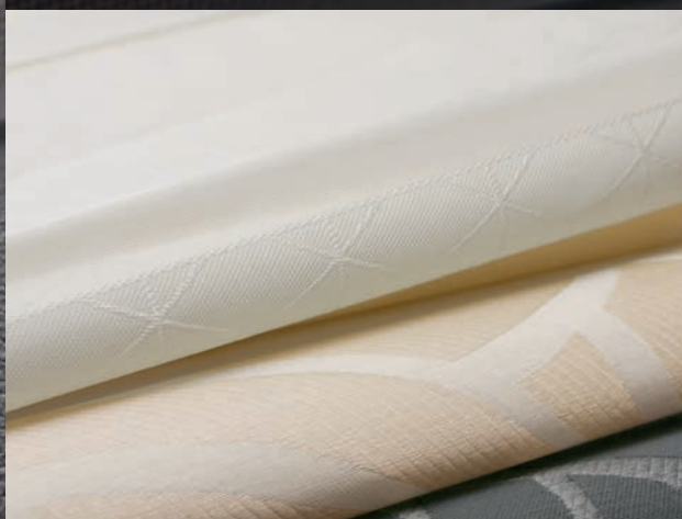
VICTOR and VIOLA are jacquard designs that give the windows a discrete look