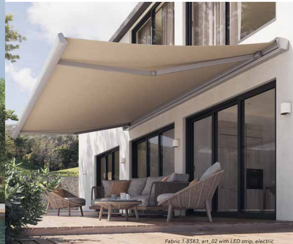
Fabric 1-8563, art_02 with LED strip, electric