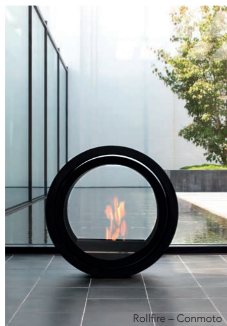
Rollfire – Conmoto