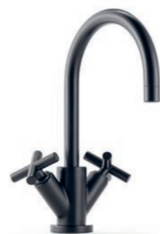
Tara – Dornbracht