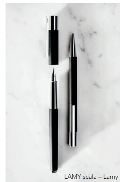
LAMY scala – Lamy

"At sieger design, we understand innovative design as an overarching creative vision. Our design process always begins with a precisely tailored, thoroughly researched strategy. Each new project is approached with a keen eye for timeless, often archetypal forms, superlative technical finesse and artisanry, and a flair for functionality, innovation and sustainability. The products we develop stand out for their distinctive style and long lifespan. The enduring success of many of our collections for national and international companies is testament to our approach. Our instinct for trends allows us to tell when it's time for a new idea – like Elements."