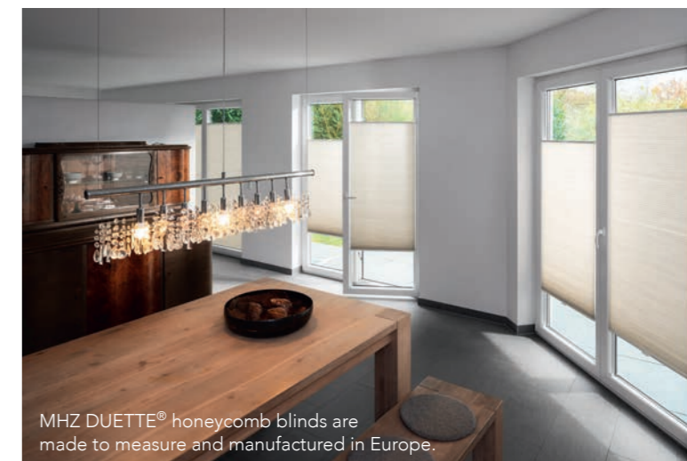
MHZ DUETTE® honeycomb blinds are made to measure and manufactured in Europe.